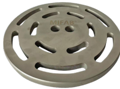
Special duty round slotted grate with finger holes (-RS) (Grate part # - P3230-PG-RS)