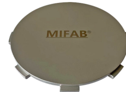
Special duty solid cover with perimeter drain gap (-PD) (Grate part # - P3230-PG-PD)